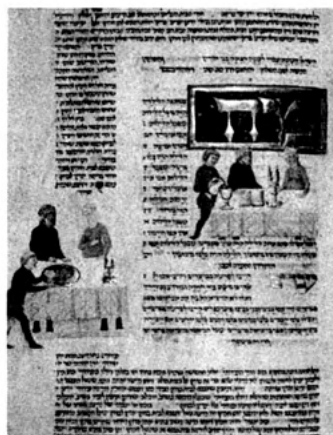
The Ma Nishtana in the Rothschild Miscellany, whose Hagada illustrations and decorations are among the finest produced

The Rothschild Miscellany proved to be an even greater challenge, for the publisher's philosophy dictates that a facsimile must be as close to the original as humanly possible. Tremendous efforts were made to acquire the finest materials and craftsmen to impart to each volume not only the presence, but also the feel, of an original manuscript.