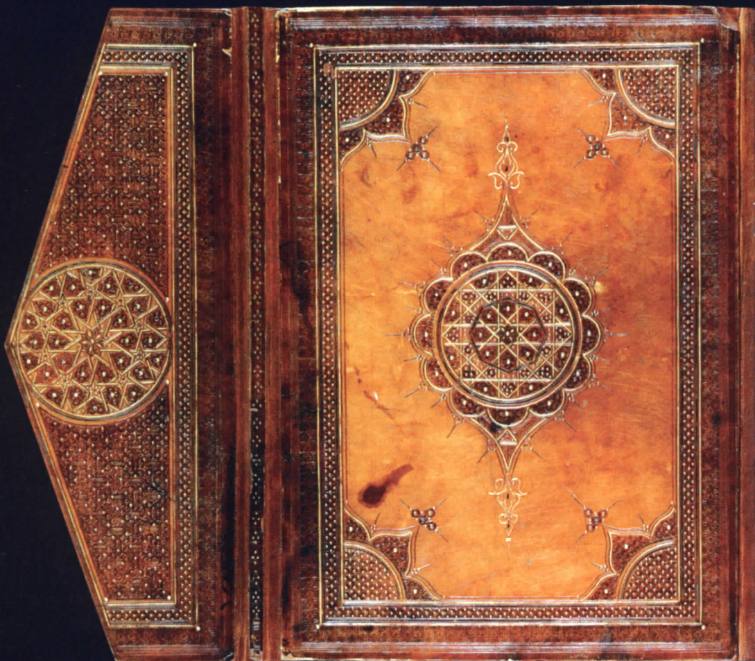
THIS MAMLUK BINDING WAS COMMISSIONED BY THE AMIR, AYTAMISH AL-BAJASI, IN CAIRO IN THE EIGHTH CENTURY OF THE HIJRI CALENDAR.