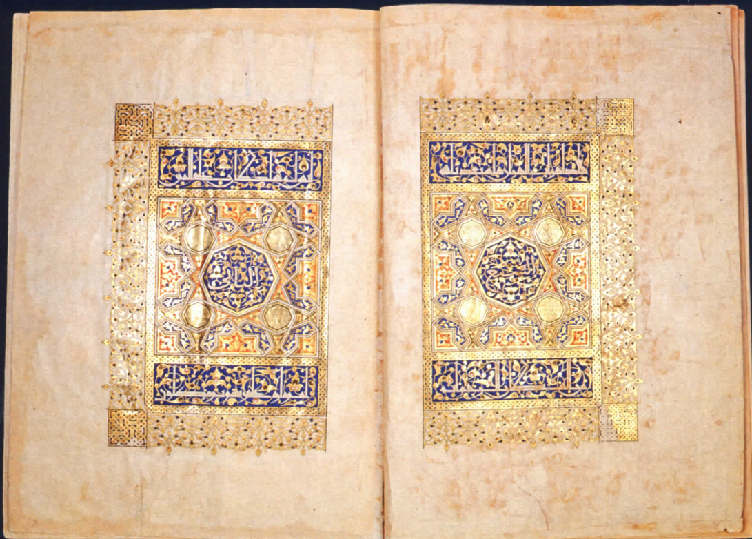
THE OPENING LEAVES OF THE SECOND VOLUME OF THE QUR'AN CONTAIN THE WORDS 'THE SECOND SEVENTH'. THE OUTER BORDERS CONTAIN A QUOTATION FROM CHAPTER 16 (SURAT AL-NAHL), VERSES 98-99.