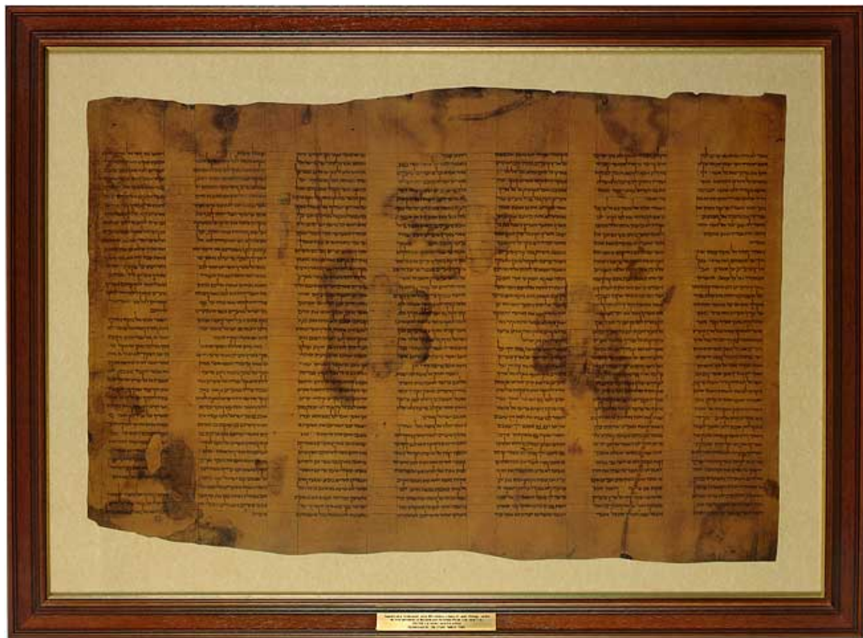
Fragment of a papyrus scroll, likely containing a letter or document, displayed in a dark wooden frame. The scroll is unrolled, showing several columns of text written in a cursive script. The papyrus is aged and stained, particularly at the edges. The text is arranged in approximately seven columns across the length of the scroll. The scroll is mounted on a light-colored background within the frame.